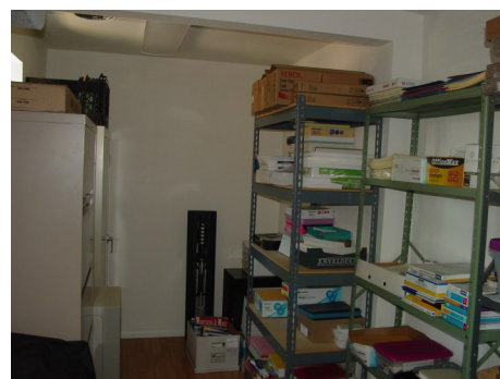
The new storage office storage space

Despite the museum being closed to visitors throughout the summer, the staff and volunteers never rest for too long in the off-season. Each year as the museum season comes to a close and the temperature begins to rise, the staff and Board members develop a project for the four-month interim ahead. This year's project involved converting a little-used exterior storage room into a convenient new storage space accessible through the museum office. This involved a slight remodel of the kitchen area as some of the cabinetry had to be removed in order to create a doorway into the new storage space. The worn, dated carpet in the office was also replaced with new laminate floors. Once this project