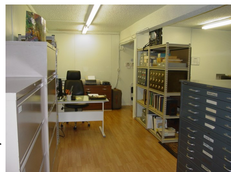
The Society archives in its revitalized location in the Museum office

The staff sincerely thanks the Board members, workers, and volunteers who gave their time and talent—paid or unpaid—throughout the summer in order to make our space more workable for staff, volunteers, researchers, and visitors. Although these improvements were not made to the public spaces of the museum, they certainly make for a more efficient and user-friendly environment, thereby allowing us to better fulfill the Society's mission of preserving our history and sharing it with the community.