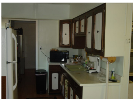
The freshly painted kitchen, with a view into the new storage space

A second component of the summer plan involved a move in the basement collections area and the recently acquired storage building just east of the museum. The main collections storage area was reorganized, with any "heat-proof" artifacts moved into exterior building. Meanwhile, Collections Manager Dawn Snell moved her office into the area that had been used for processing the textile collection. Dawn's old office space underwent drywall repairs due to water damage and received a fresh coat of paint. It now serves as the textile storage extension area since the collection was completely processed.