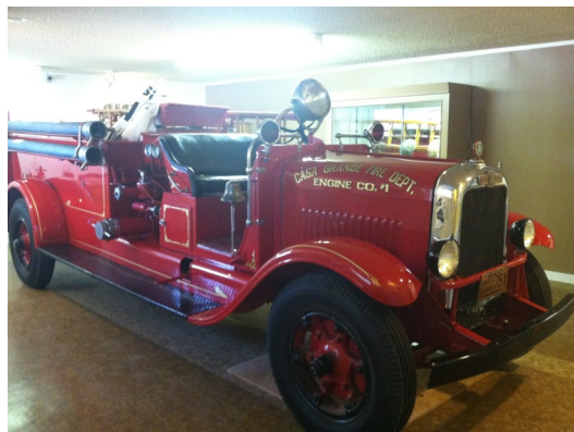
The 1929 La France fire engine, back in its Museum home