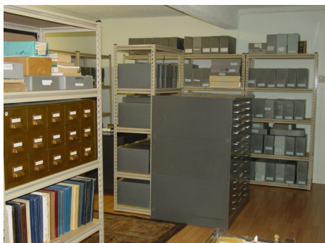
The archives after its relocation to the first floor Museum office

Despite the museum being closed to visitors throughout the summer, the staff and volunteers never rest for too long in the off-season. Each year as the museum season comes to a close and the temperature begins to rise, the staff and Board members develop a project for the four-month interim ahead. This year's project involved converting a little-used exterior storage room into a convenient new storage space accessible through the museum office. This involved a slight remodel of the kitchen area as some of the cabinetry had to be removed in order to create a doorway into the new storage space. The worn, dated carpet in the office was also replaced with new laminate floors. Once this project got underway, due in large part to President Jim Sommers—who donated his time nearly every weekend of the summer—the staff decided on one more change. A majority of the archives is now housed in the first floor office space, while the second floor now serves as the administrator's office and as storage for additional office files, as well as providing a small space for exhibit design. Having the archives downstairs allows for easier access for staff and researchers alike.