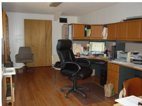
The relocated Administrator's office on the second floor